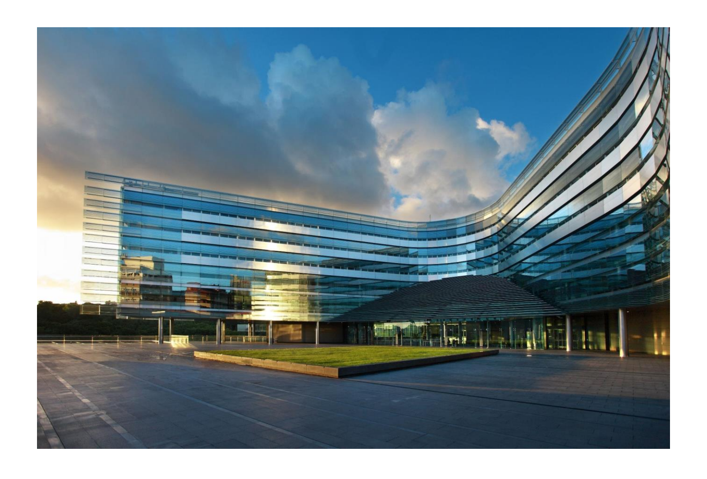
8<sup>th</sup> and 9<sup>th</sup> of February 2024 The University of Auckland, New Zealand Conference Programme